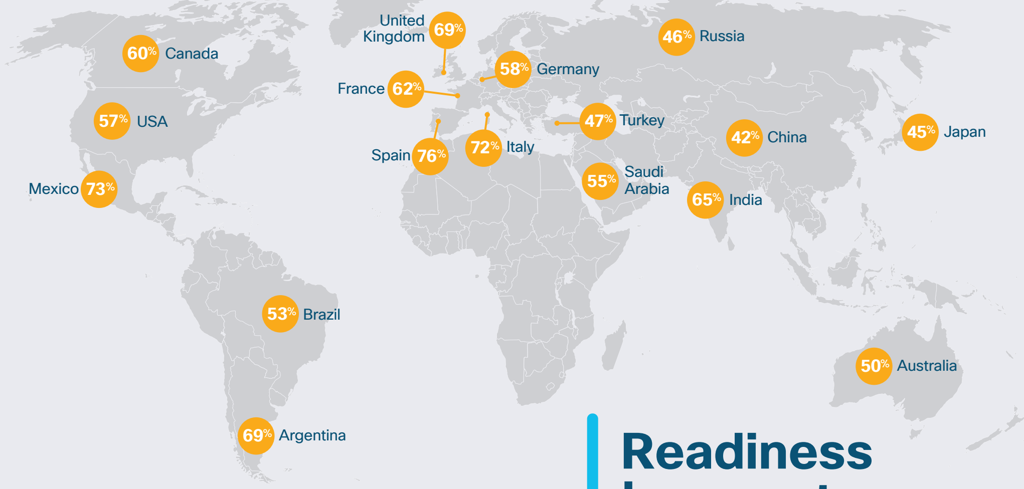
Readiness by country